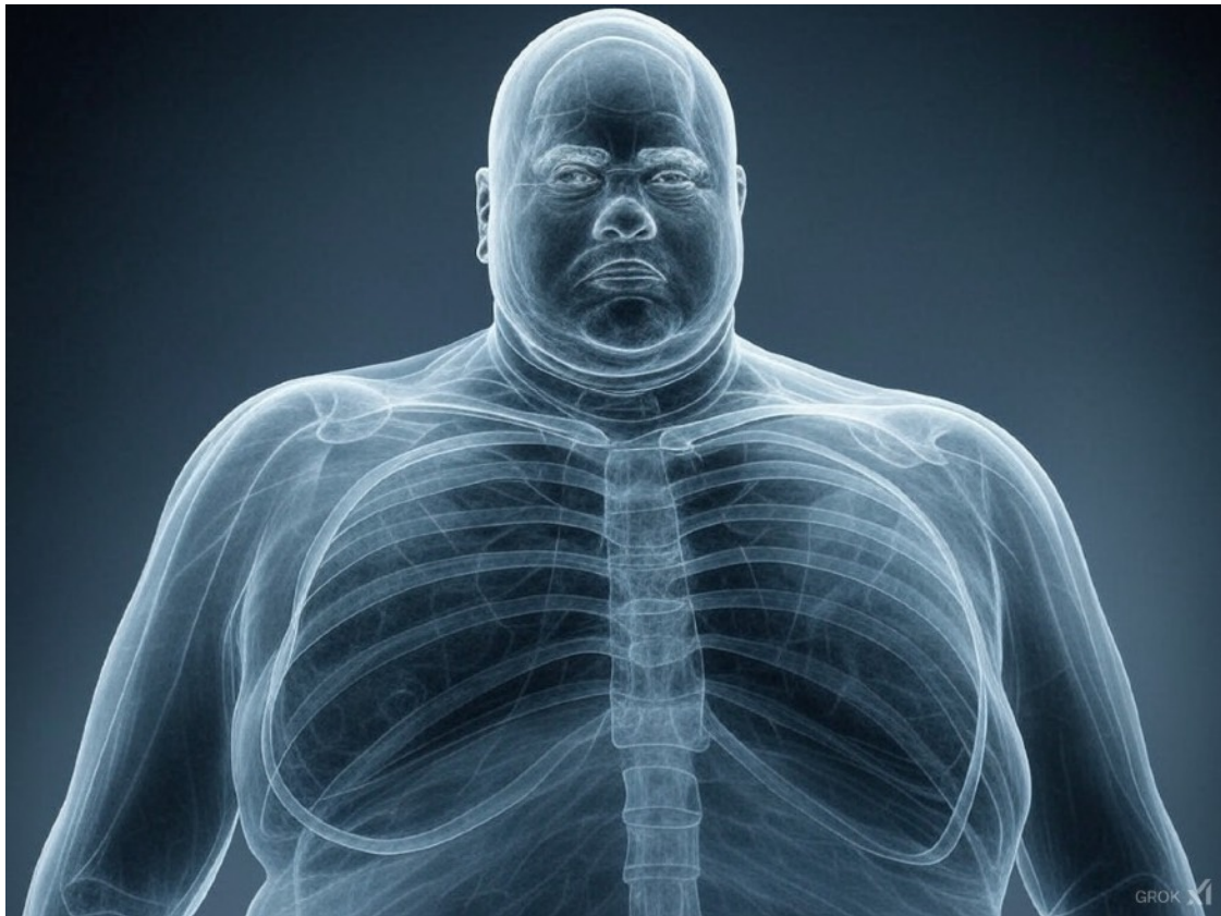
fig. 2: Elon simp

For example, Musk's environmental advocacy is celebrated, while his personal choices (like private jet usage or relationships tied to fossil fuels) are dismissed as irrelevant or misunderstood. This selective reasoning allows the Simp to maintain their belief in Musk's infallibility, even in the face of glaring inconsistencies. Over time, this pattern reinforces a worldview where Musk can do no wrong, and any criticism is dismissed as ignorance or malice.